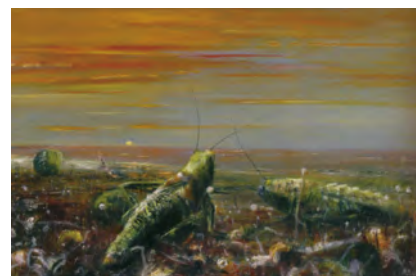
2 Hiromi KISHIMOTO Locusts on the Shore (2001) Oil paint on canvas