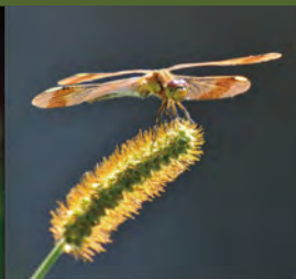
▲ Sympetrum pedemontanum elatum