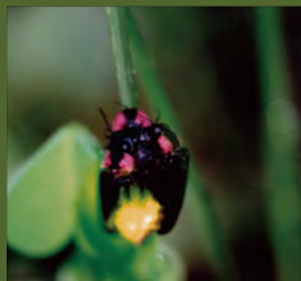
▲ Heike firefly ( Luciola lateralis )

Farmers in Bihoro began to use tractors in 1952. These were brought to Bihoro as part of a project that aimed to improve soil through mechanization. Farmers expected a lot from the powerful tractors that replaced their horses. In those days, a horse could till half a hectare of land in a day, versus the 2 to 3 hectares per day of a tractor.