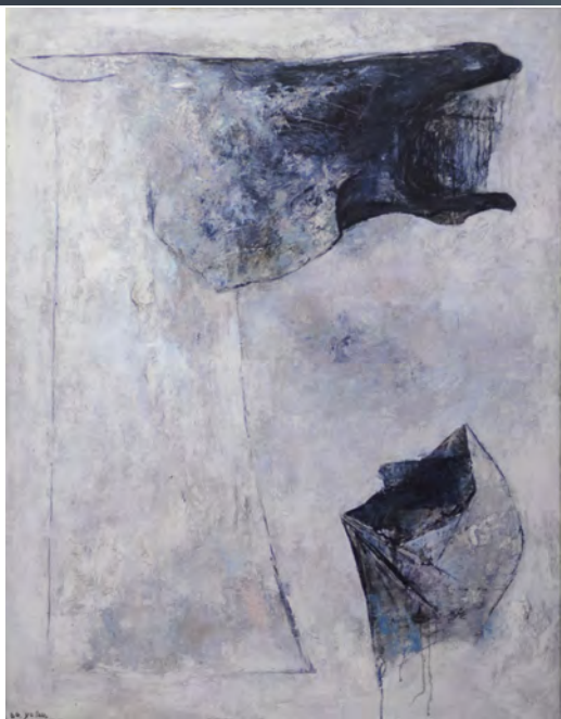
3 Masaaki YOKOMORI A Horse and a Man (1964) Oil paint on canvas