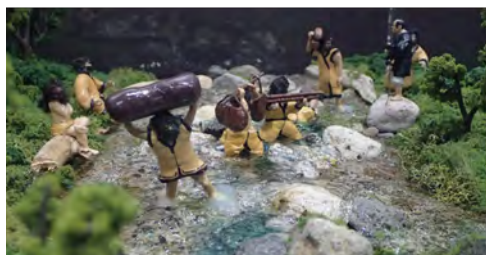
▲ Wading the rushing Abashiri River

Let's look inside a chise, a traditional Ainu dwelling. We can see a net on the earth floor. It is used for a river fishing technique called urai. A fireplace is in the center of the room, and a kina mat of woven cattail leaves is laid out. The space at the back of the room was used for storing valuable items, including various pieces of lacquerware that the Ainu acquired through trade with Japanese.