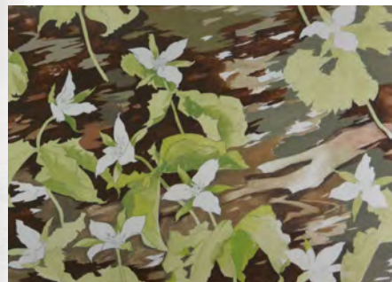
1 Naoji OSAME Flowers (Date unknown) Watercolor on paper

The Bihoro Museum has a collection of 2,000 artworks related to Bihoro.