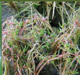
▲ Water pygmy weed ( Tillaea aquatica )