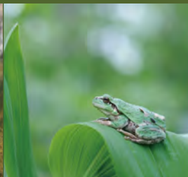
▲ Japanese tree frog ( Hyla japonica )