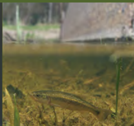
▲ Sakhalin lake minnow ( Rhynchocypris perenurus )